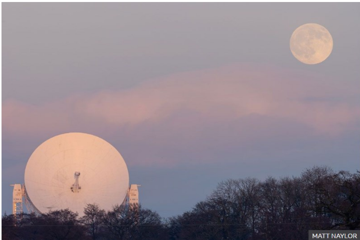
Moonrise over Jodrell Bank, Cheshire, where sits the Lovell Telescope.